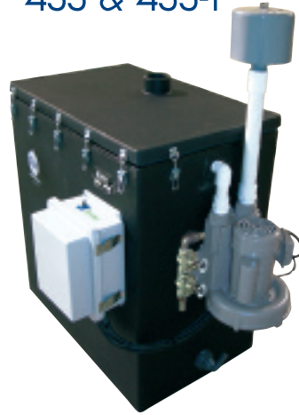
433 & 433-1