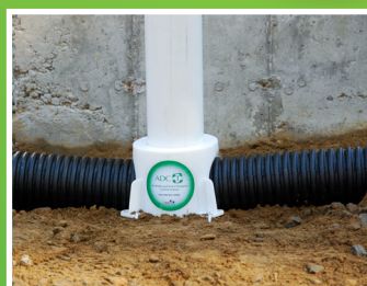
New Construction Installation

RadonAway ™ The world's leading radon fan manufacturer www.RadonAway.com/adc-t 800-767-3703