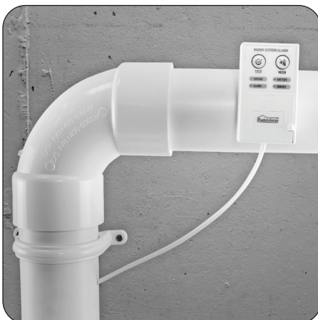
Remote horizontal pipe mount