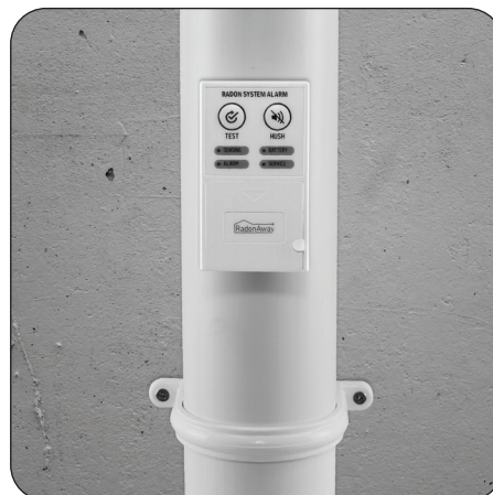
Direct vertical pipe mount