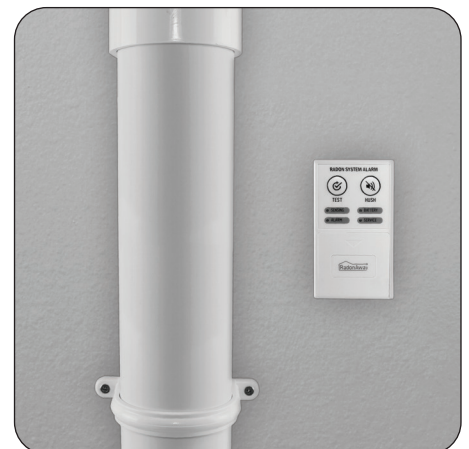
Remote wall mount