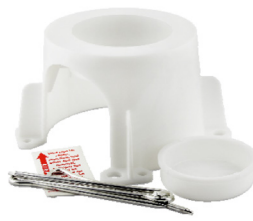
Radon-T P/N 28353, 28354 Single, 12-Pack