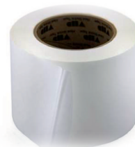
Tape P/N 68017, 68066 Black, White