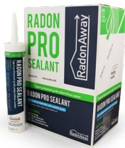
RadonAway Hybrid Sealant P/N 28523